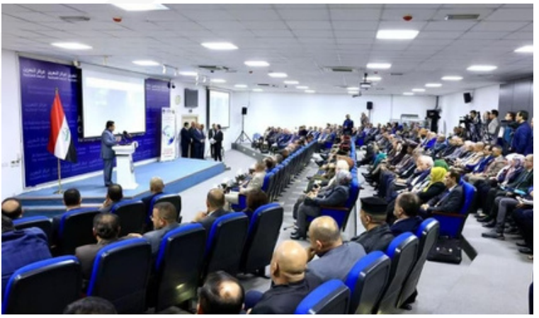
In-person conference attendees gathered in the main conference hall at Al-Nahrain Center for Strategic Studies.